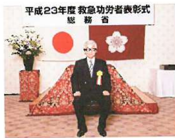
#A23年011911 於 KSR HOTEL TOKYO