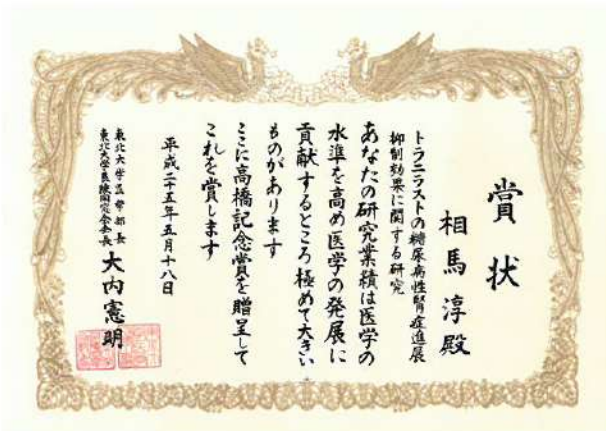
高橋記念賞 (東北大学良陵同窓会優秀業績 平成 25 年 5 月 18 日)