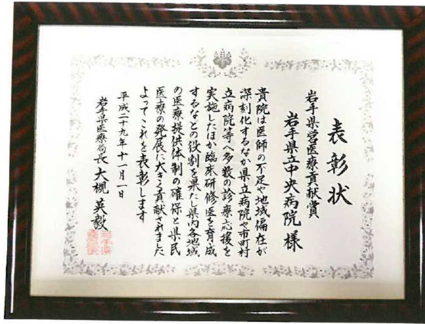
岩手県営医療貢献賞 (医療提供体制の確保と県民医療の発展に貢献 平成 29 年 11 月 1 日)