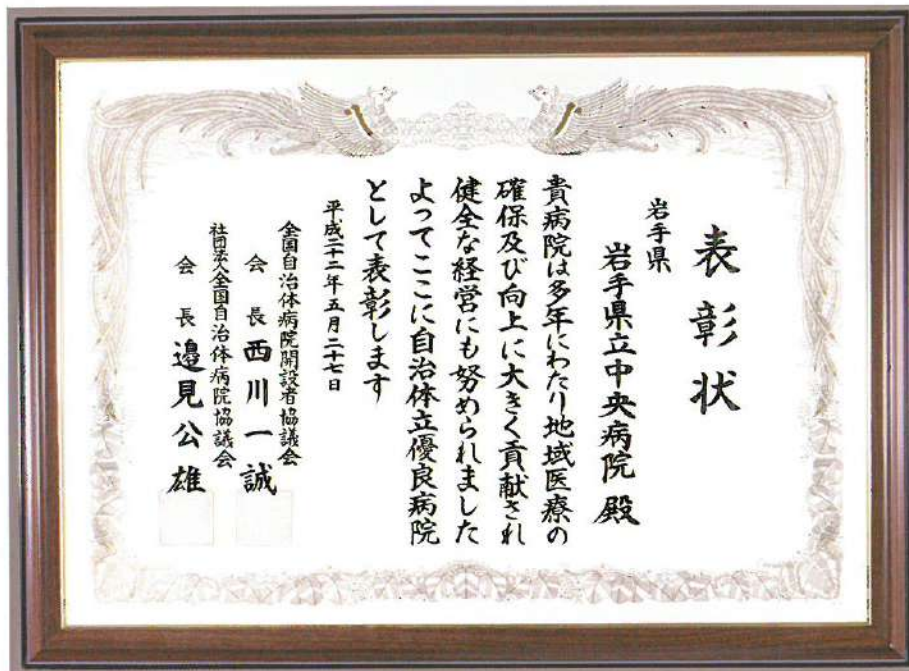
自治体立優良病院賞 (地域医療の確保及び向上への貢献 平成22年5月27日)