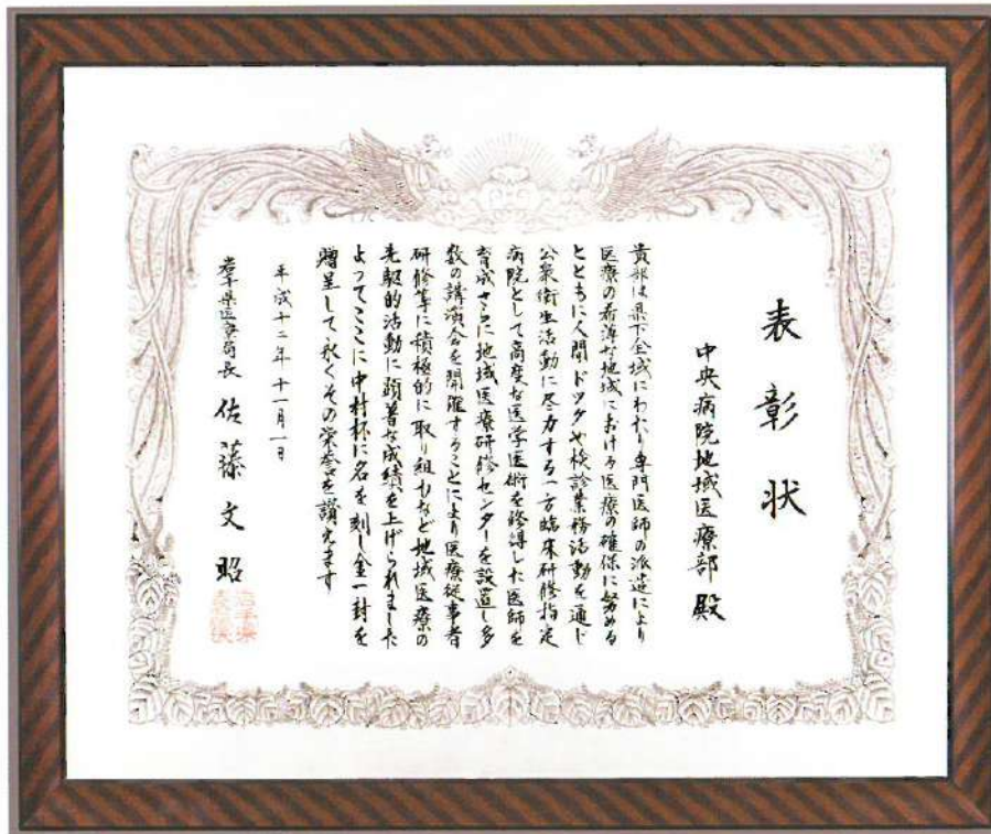
中村賞 (地域医療における先駆的活動 平成12年11月1日)