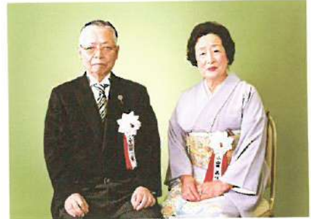
旭日中綬章受賞（平成 20 年 4 月 29 日）